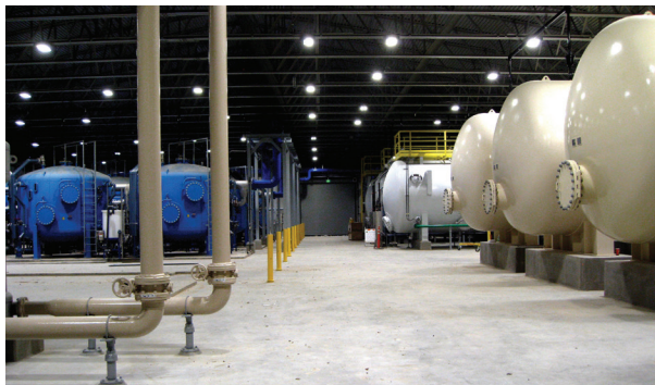
San Angelo, TX