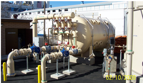
Los Angeles, CA

Loprest pressure filters can be provided in horizontal or vertical configurations for flow rates from 50 to 5,000 GPM. The Loprest multi-cell pressure filter design produces its own backwash water, so there is no need for a separate treated water source and pumping system. The Loprest filter design has been optimized over many years for reliable, efficient, economical operation. All Loprest treatment systems are operated by a fully automated control package.